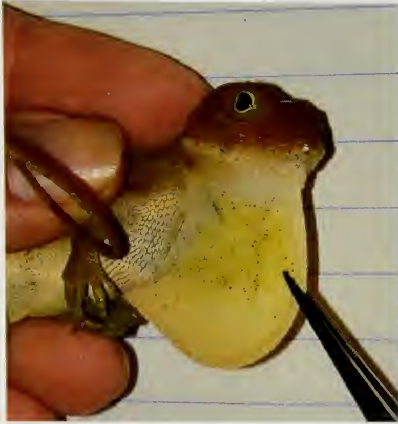
Figure 1. A male Anolis cybotes infested with Eutrombicula alfreddugesi mites on its dewlap (throat fan).

small, orange-colored mites are most commonly found in densely vegetated areas with high humidity and moderate ambient temperature (Clopton and Gold, 1993; Bulté et al. , 2009). The larvae attach to anoles through direct contact and typically cluster in skin folds, especially behind the front and back limb joints and on the dewlap, an extensible throat fan used extensively in Anolis communication (Fig. 1). Mites can cause lesions, blood loss, and skin inflammation in lizards (Goldberg and Bursey, 1991; Goldberg and Holshuh, 1992) and can transmit pathogens. In Asia, chigger mites are known to transmit scrub typhus (Traub and Wisseman, 1974), and, more generally, mites might be vectors for bloodborne parasites known as haemogregarines, which are known to reduce burst speed in lizards (Oppliger et al. , 1996; Garrido and Pérez-Mellado, 2014).